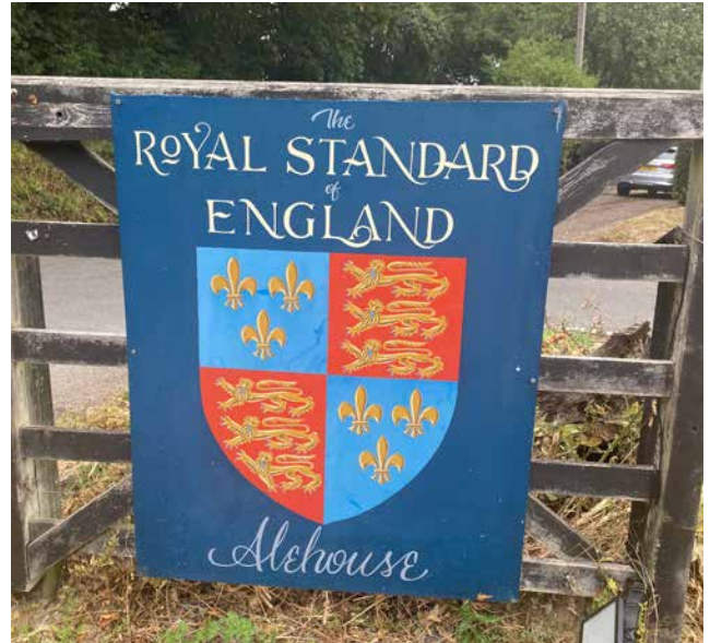
Figure 52: Sign for the Royal Standard Pub in Forty Green.