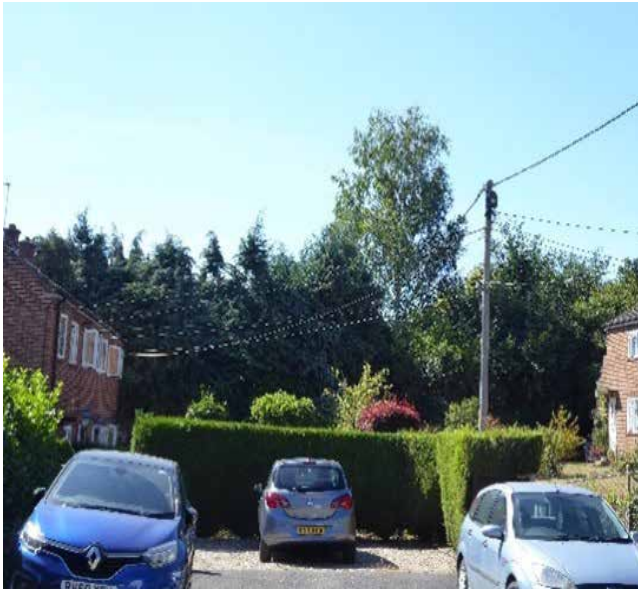
Figure 51: Terraced housing within Gomms Wood Close.