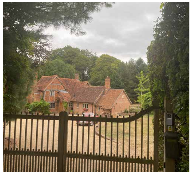
Figure 54: The listed Hill Farm Cottage and Barn