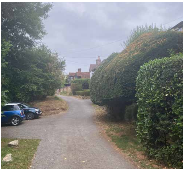
Figure 53: View westwards up Brindle Lane