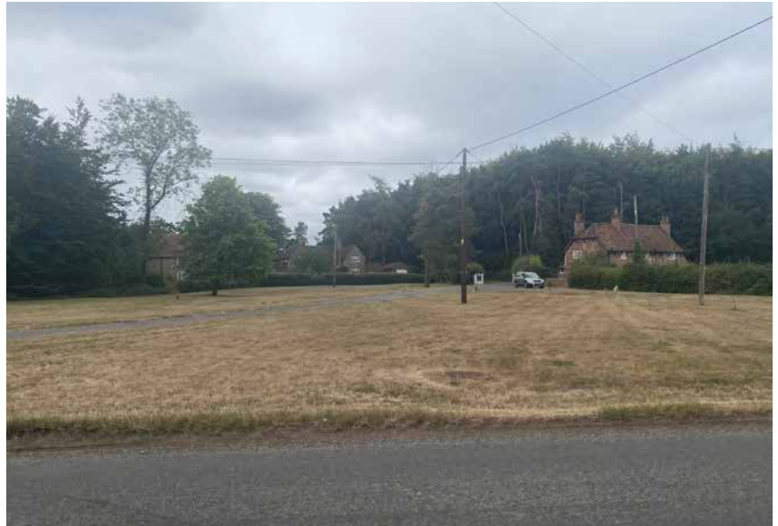
Figure 36: An example of detached housing which is facing onto the green