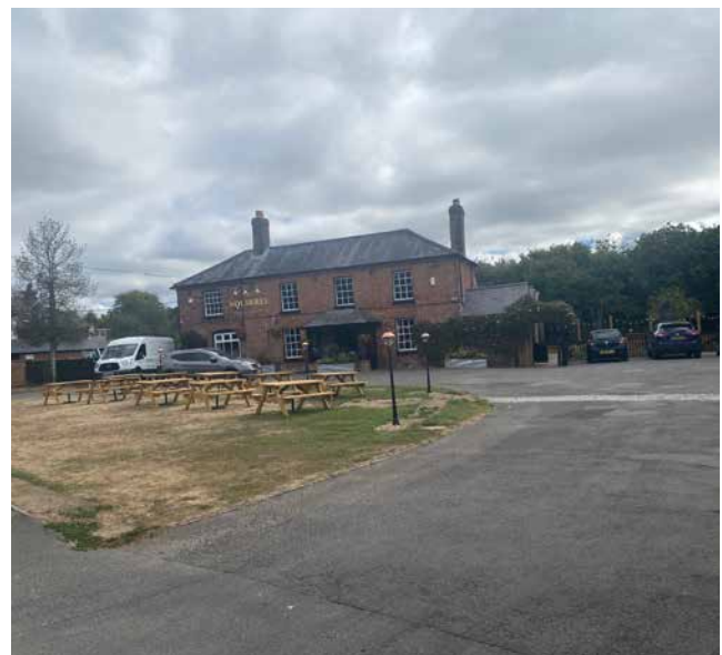
Figure 38: Local pub opposite the common