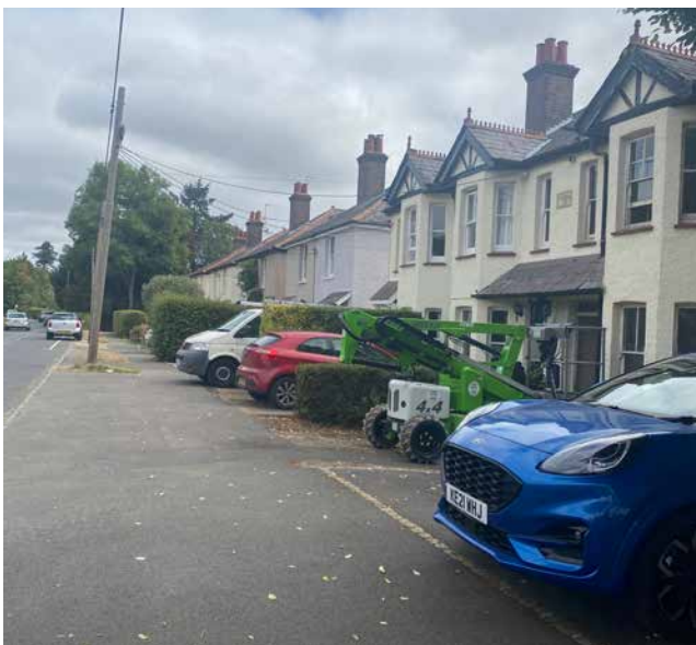
Figure 37: An example of terraced housing on Penn Street where there are less distinctive boundaries