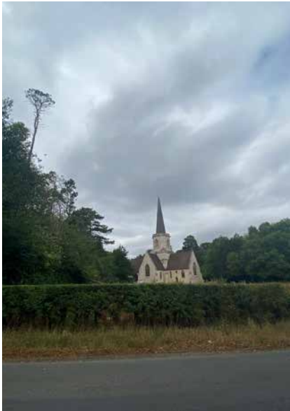
Figure 35: The Holy Trinity Church surrounded by ancient woodland